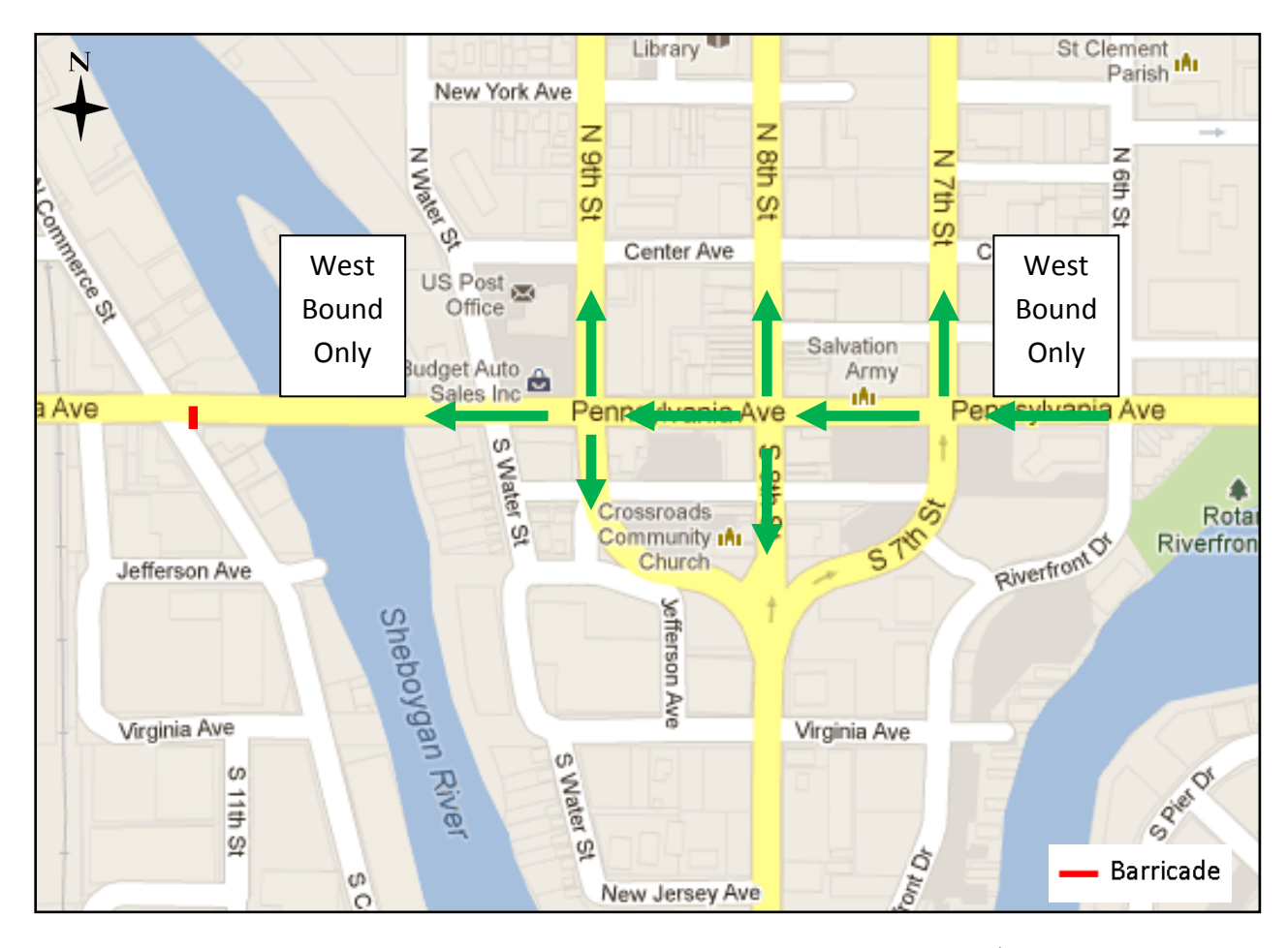
Eastbound traffic on Pennsylvania Ave will not be permitted beyond 14<sup>th</sup> Street.